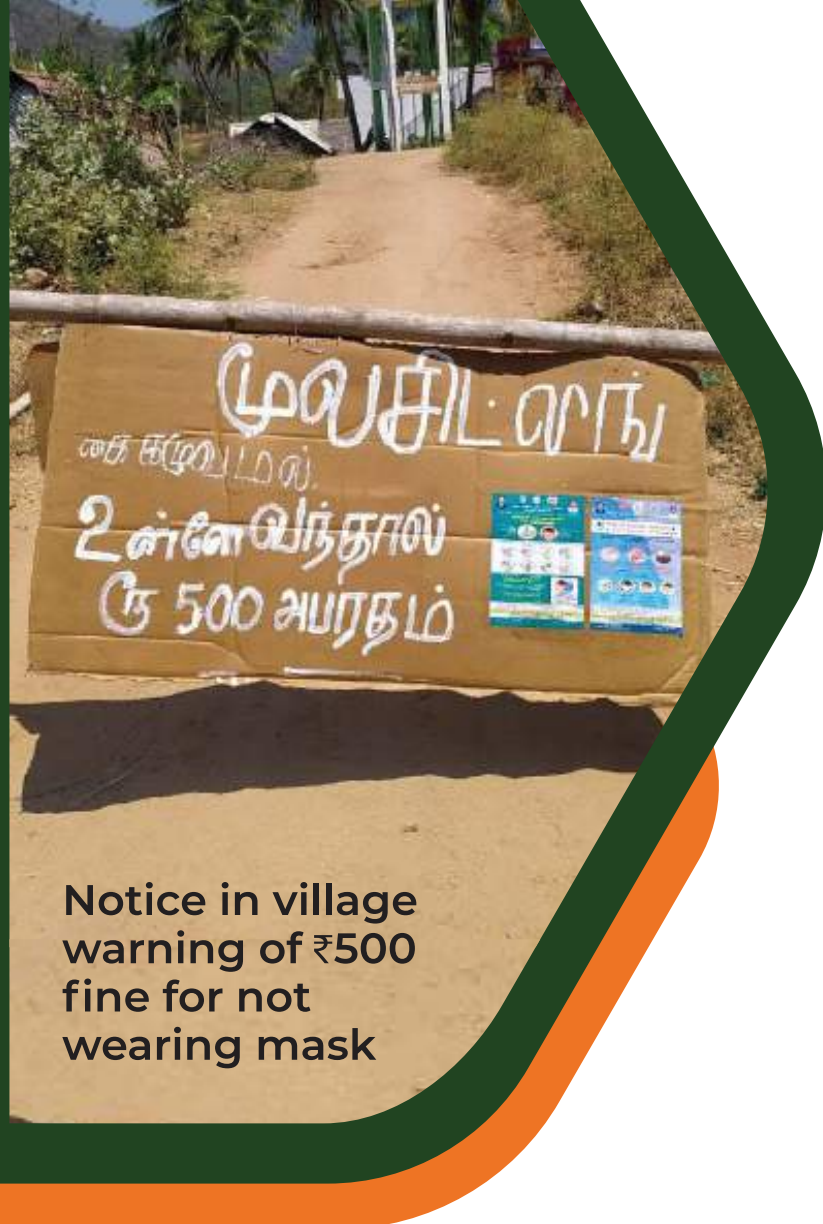
Notice in village warning of ₹500 fine for not wearing mask

Tribal Hospital helped with a fever OPD and our intense work on food security during the past 10 years meant that no family went hungry.